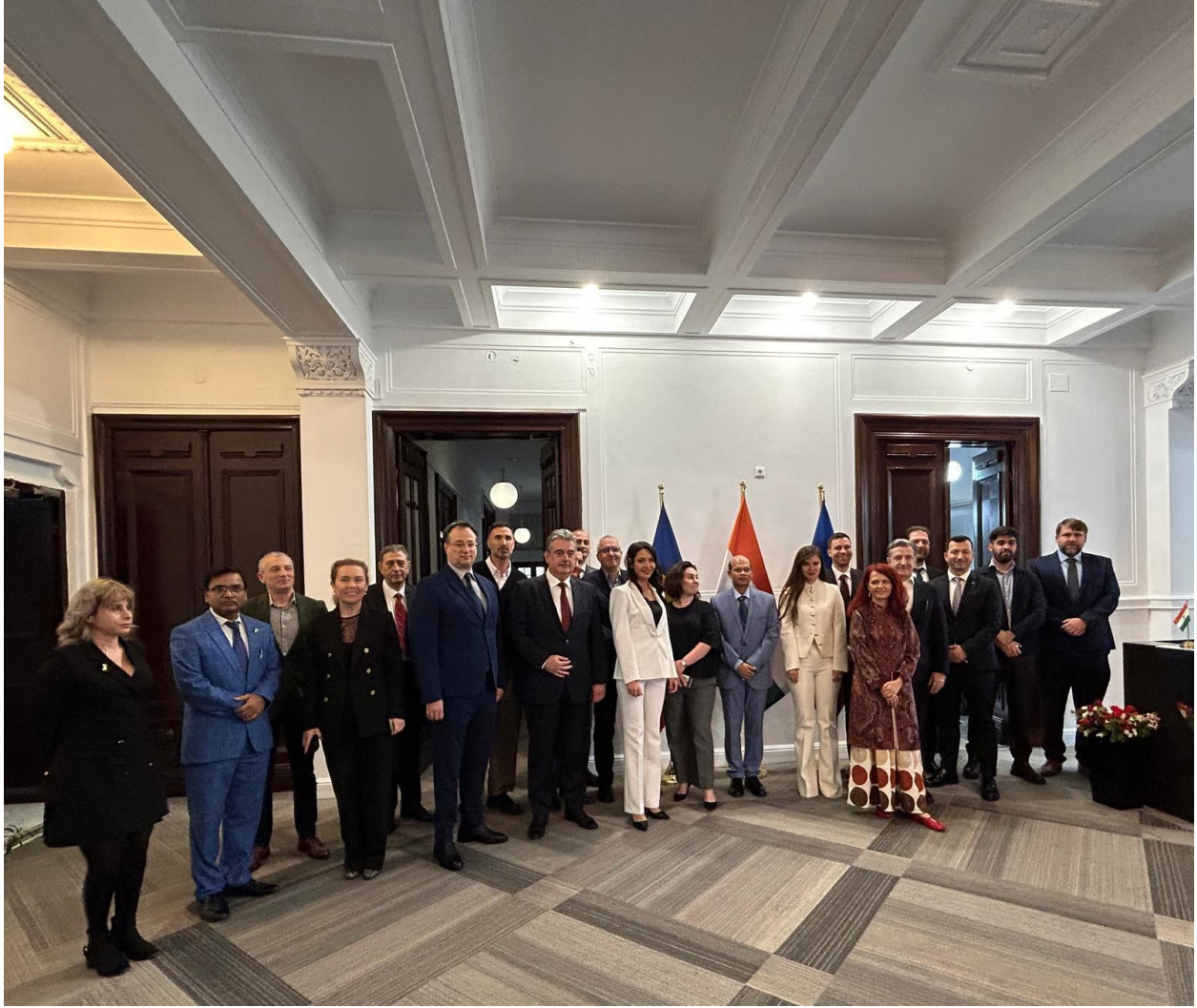
Group photo : Hybrid B2B Meeting on Renewable Energy