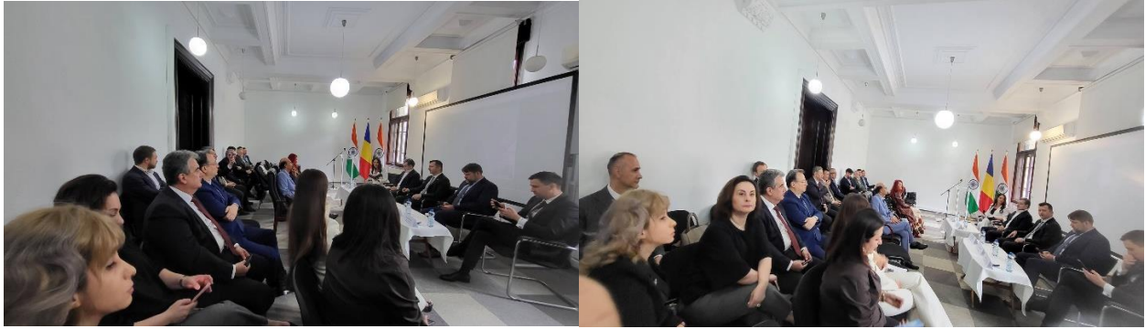
A panel discussion featuring distinguished experts provided in-depth insights of the energy sector: